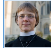
Bishop Mariann Edgar Budde of the Episcopal Diocese of Washington

"The presidents are welcome as citizens of this country to pray alongside fellow citizens to kneel before God in humility and to rededicate themselves to the task to which they've been elected," Budde said. "In that posture, he and any president is welcome. But he is not entitled to use the spiritual symbolism of our sacred spaces and our sacred texts to promote or to justify an entirely different message."