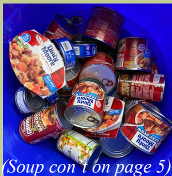
(Soup collection on page 5)

Last week, we collected beef stew for the foodbank. The stew (along with the large bottle of cooking oil someone donated) weighed 50 pounds, which translates to 42 meals. Meanwhile the number of donations we've set aside to dedicate during Easter service has also grown. Most significantly, there are now two 6-lb. cans of green beans on the table. And, if you look closely, you can spot the tuna fish mixed in with last week's beef stew. So, if you would like to add to the collection, please do.