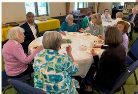
April 19 —Easter Breakfast