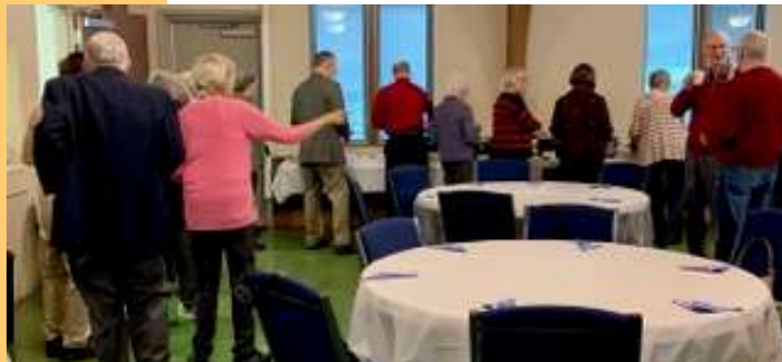
January 19 - The annual soup lunch and transition to new Governing Board.

At this time of year, news anchors and the rest of us, often reflect on the year that has just passed. This is my photo reflection of NCCC's year.