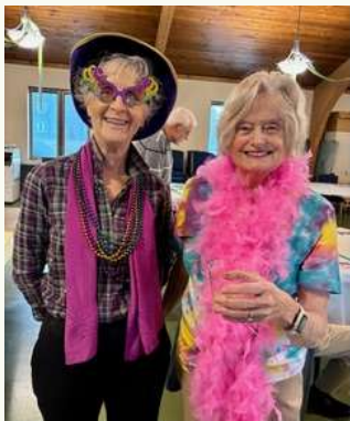
March 4 NCCC's First-ever Mardi Gras Party